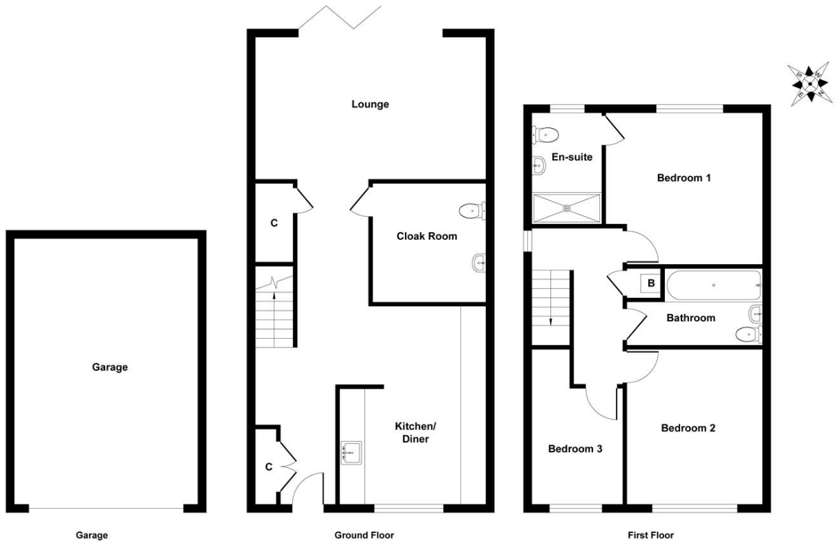
Illustration for identification purpose only, measurements approximate and not to scale, unauthorized reproduction is prohibited. All rights reserved for Alexander Hudson Estates