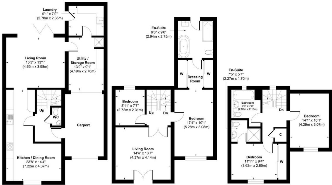
Ground Floor Approximate Floor Area 760 sq.ft (70.63 sq.m)