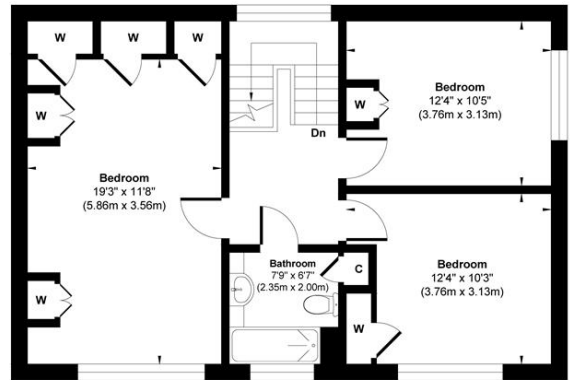
First Floor Approximate Floor Area 652 sq.ft (60.59 sq.m)

Approx. Gross Internal Floor Area 1849 sq. ft / 171.77 sq. m (Including Garage)