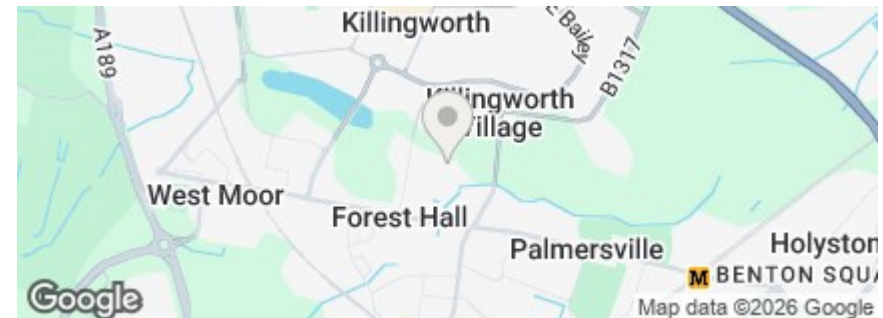
Illustration for identification purpose only, measurements approximate and not to scale, unauthorized reproduction is prohibited. All rights reserved for Alexander Hudson Estates

Approx. Gross Internal Floor Area 1613 sq. ft / 149.74 sq. m (Excluding Garage)